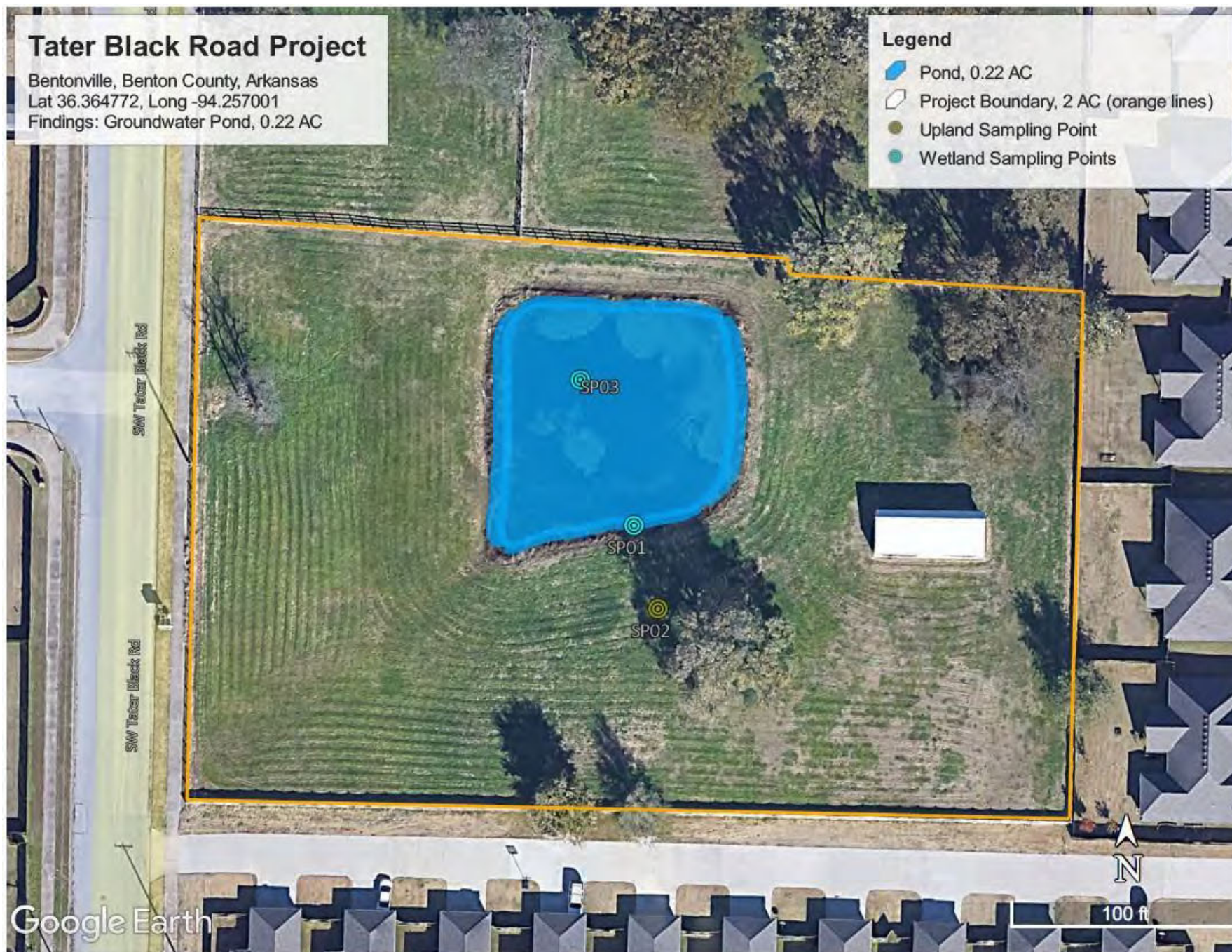
Figure 1-2. Field Data map for the Tate Black Road Project, Bentonville, Benton County, Arkansas.